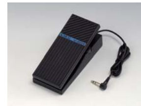
V-20X Expression Pedal