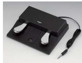
F-20 Double Pedal