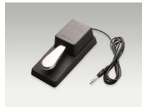
F-10H Damper Pedal